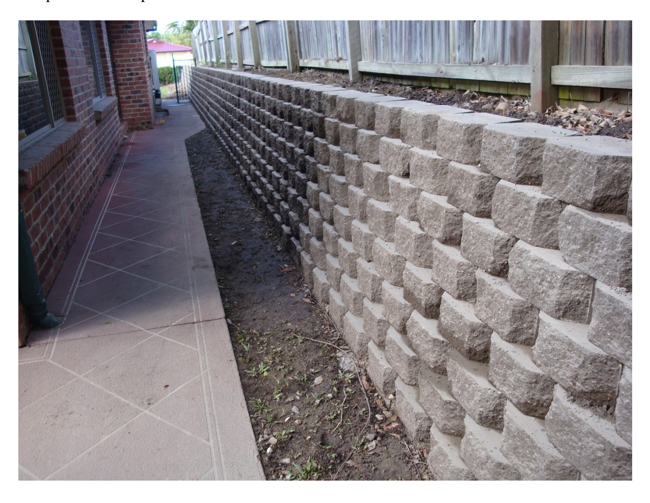
See picture of completed wall below –